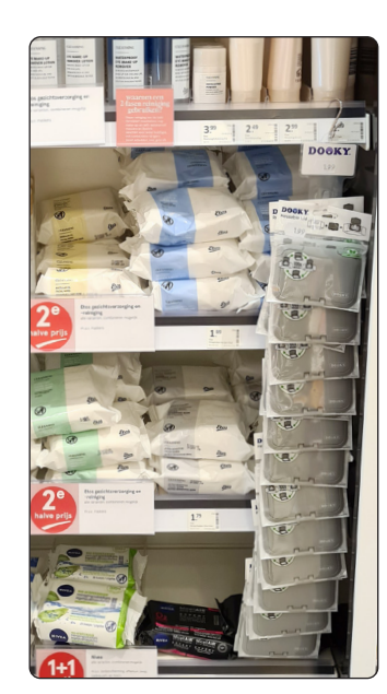
Etos (drugstores & cosmetics)