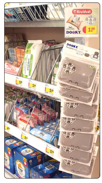
Kruidvat Drugstores (A.S Watson)